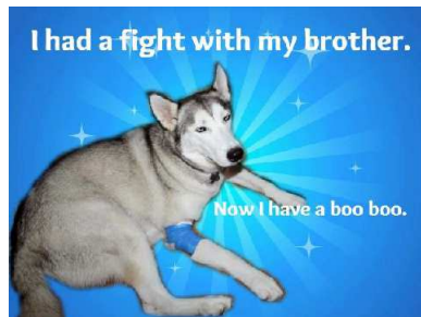
The Adventures of Scout (formerly Lion)